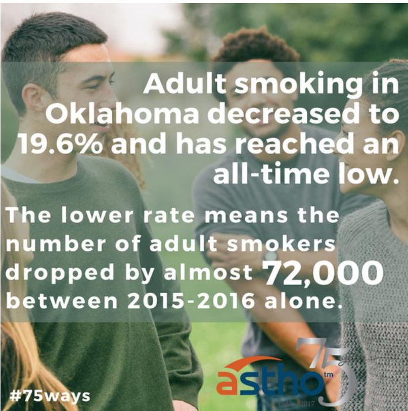
See more public health successes at: my.astho.org/75ways

State health agencies are working across the country to actively protect the public's health, prevent avoidable diseases and conditions, and promote healthy communities.