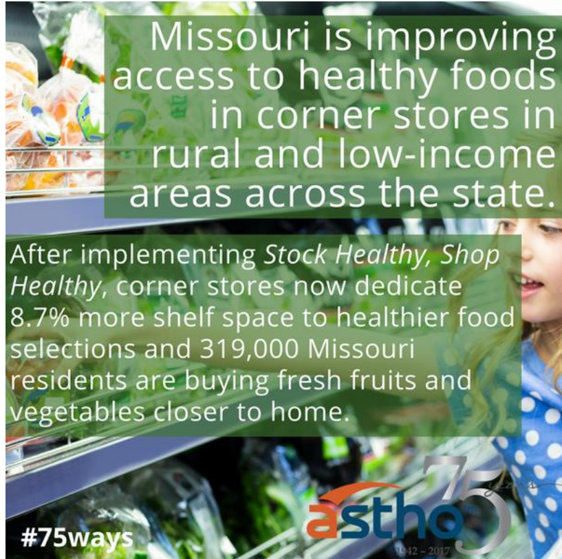
See more public health successes at: my.astho.org/75ways

State health agencies are working across the country to actively protect the public's health, prevent avoidable diseases and conditions, and promote healthy communities.