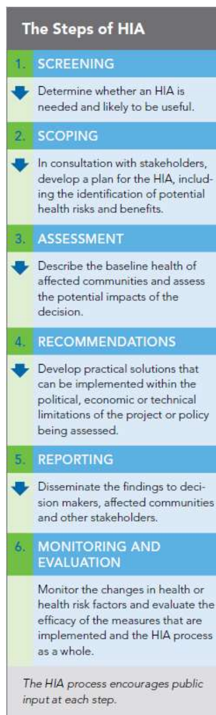
Figure 2. The HIA Process 18

However, a review of the literature demonstrates that individuals with conditions such as asthma, chronic lung disease, coronary heart disease, and heart failure who are exposed to air pollutants suffer more significant adverse health impacts compared to the general population. 16,17 In addition, although risk assessments used to generate regulatory health based standards and guidelines consider sensitive populations like infants or the elderly, ambient levels of air pollutants below those standards and guidelines (e.g., PM 2.5) often used in the environmental regulatory process can present significant health concerns in communities with preexisting health burdens higher than state and national trends. Thus, as a tool that defines health more broadly, HIA can complement the NEPA/SEPA process to illustrate a more comprehensive analysis of impact.