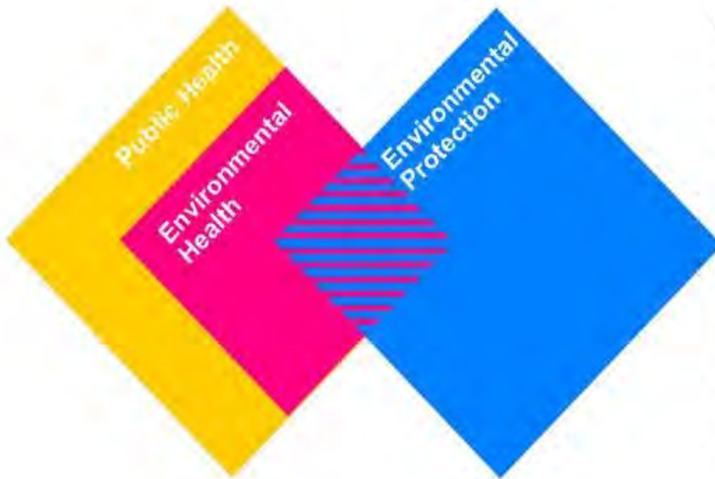
Diagram courtesy of Australia's EnHealth.

“Public health programs designed to protect the public health from hazards which exist or could exist in the physical environment.”