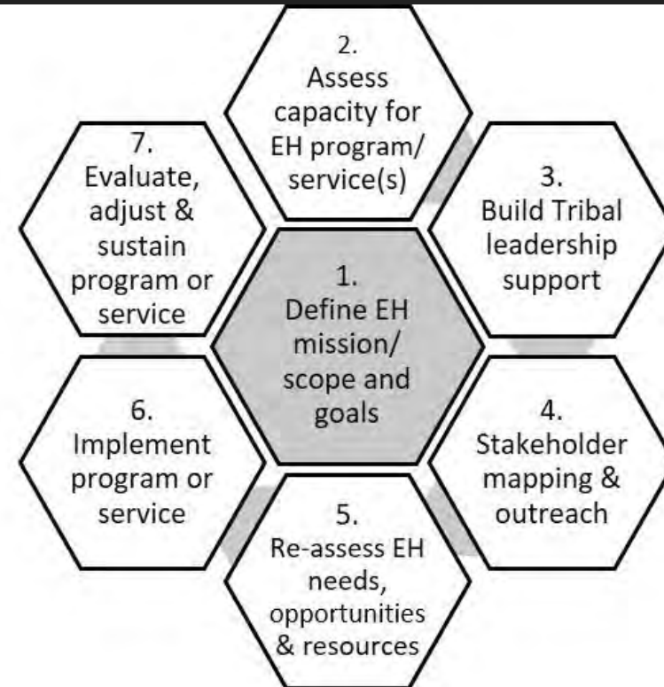
Figure 1.1 Roadmap for Developing Tribal EH Programs and Services